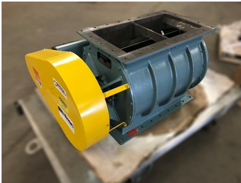
12"x24" Model HC Rotary Valve