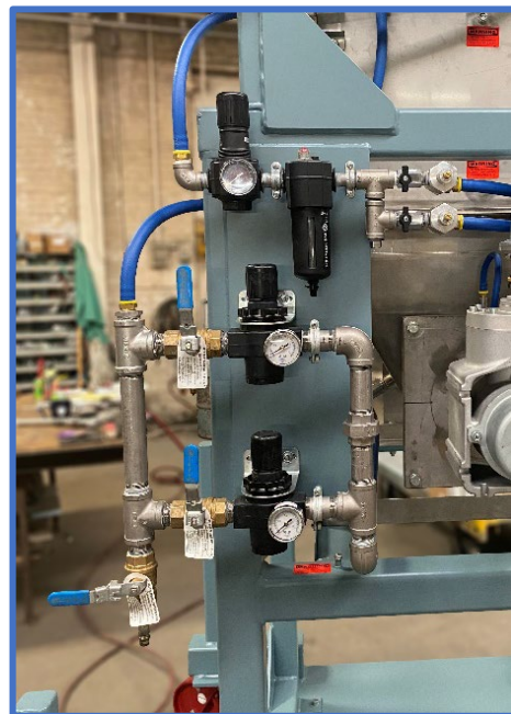
Pneumatic Controls, Single Compressed Air Inlet