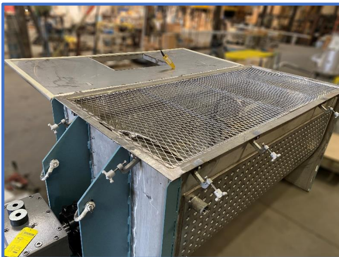
Perforated Metal Between Body & Cover