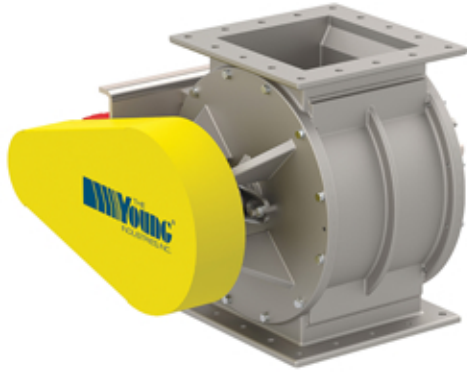
Standard 10" Model HC Rotary Valve