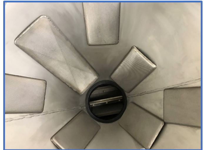
View in hopper showing small & large Transflow Fluidizing pads

3.75" x 7" and 4" x 12" Transflow pads are normally in stock and available for immediate shipment.