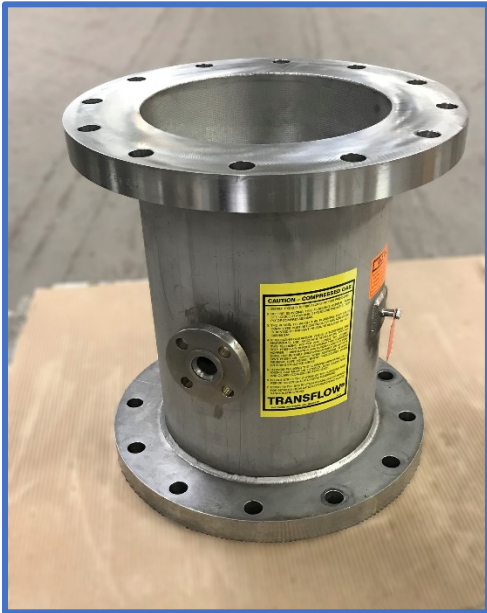
12" dia., 150 PSIG Downspout

Young Industries provides a wide range of Transflow fluidization and conditioning products. Some are rather complicated and some very simple. Recently we received a request from a customer for a 12" diameter spout, 18" high with a design pressure of 150 PSIG and design temperature of 212 degrees F. This customer currently uses Transflow fluidization in some of their powder handling processes. They know first-hand how Transflow gently fluidizes and conditions dry powders to eliminate bridging. As part of the specification the spout was to be lined with Transflow fluidization media.