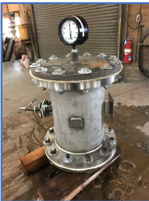
Hydro-Test @ 195 PSIG

Young Industries is an ASME code certified shop. We designed and fabricated this simple down-spout to meet ASME Code Section 8, Division 1, with UM stamp. This Downspout meets our customer's requirements for design pressure and temperature conditions, and the Transflow lined interior will provide trouble free operation with the fine cohesive powders handled.